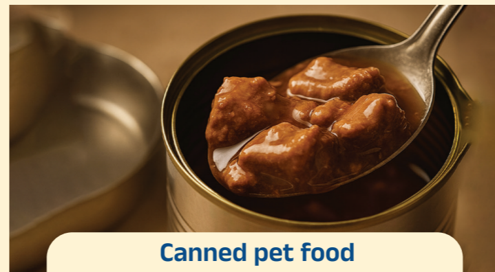
Canned pet food