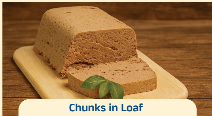
Chunks in Loaf