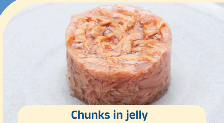
Chunks in jelly